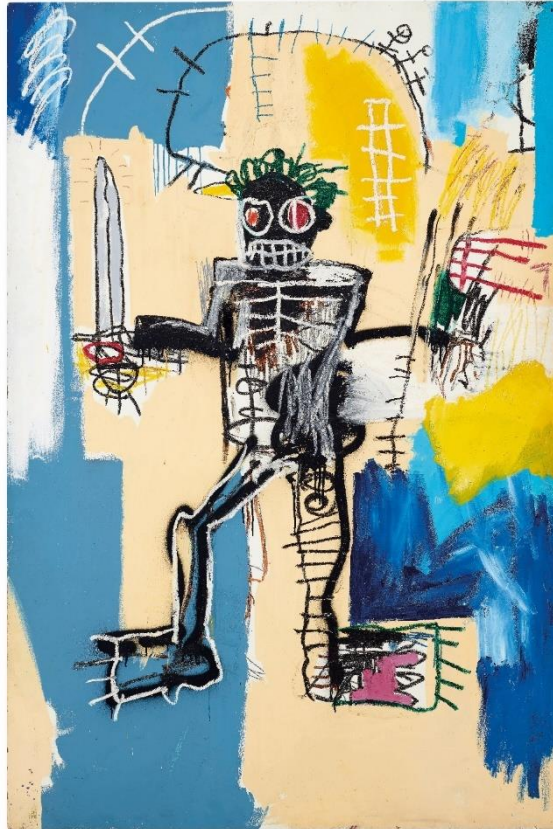
Jean-Michel Basquiat (1960-1988)

An Exclusive Single-Lot Evening Sale, Part of Christie's Spring 20 th Century Season in March