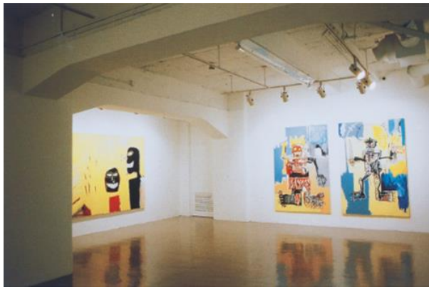
Installation view, Akira Ikeda Gallery, Tokyo, Jean-Michel Basquiat, 1983, showing (left to right) Untitled (1982) and the present work.